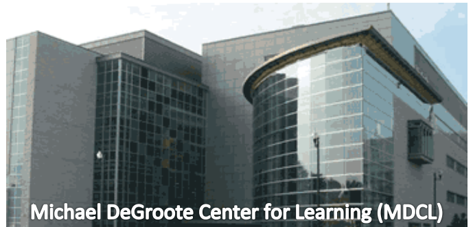
Michael DeGroot Center for Learning (MDCL)

If you drive to campus, you will need to pay a deposit for parking. We will have parking passes for your exit, $12.00/day. Parking is available at McMaster University off Sterling Street in Zone B (2) close to the Michael DeGroot Center for Learning (MDCL) building.